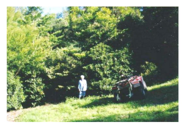
An adjacent area, where the plantings are 3 years and 3 months old. See what can be achieved in just a few years!

This project demonstrates how Contracting Services can contribute in assisting private landholders with the most labour-intensive stages in the revegetation process. We can provide a huge boost (both physically and psychologically!) to make seemingly daunting tasks achievable.