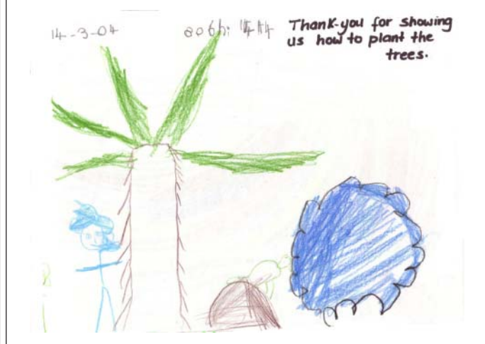
The children absorbed more than one thinks at the time.

Just a quick note to say many thanks for your time and effort with us on Thursday 10th March.