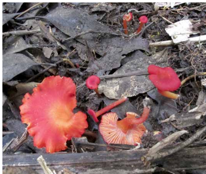
Hygrocybe miniata .

A couple of weeks later I also found it in a similar environment on the Baroon Pocket walk.