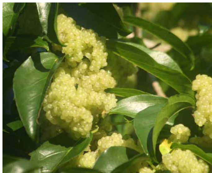
Above: Shiny-leaved Stinging Tree. Below, from left: Red Apple, Large-leaved Wilkiea, Smell-of-the-bush.

To book or for more information, email rangebees@live.com.au