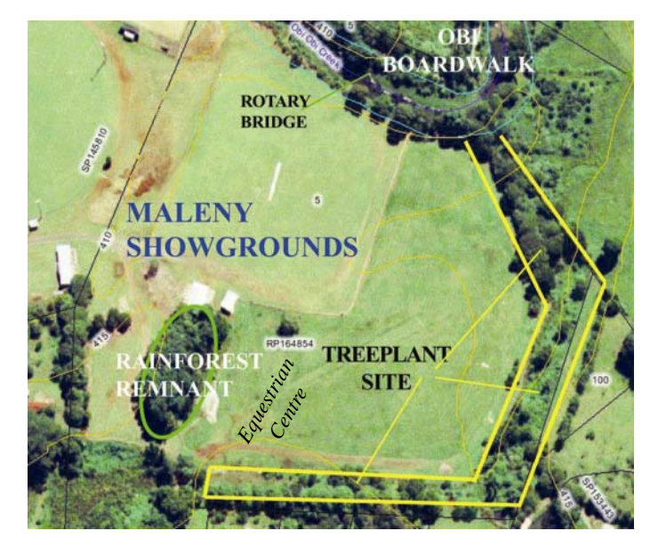
The IGA CONNECTION Treeplant is linking the rainforest remnant at the Maleny Showgrounds to the Obi Boardwalk section of Obi Obi Creek.

If you have been touched, either directly or indirectly, by the IGA's generosity towards our community, we offer you a chance to give back by sponsoring a tree. You can do this simply by phoning Barung on 5494 3151, emailing barungadmin@big.net.au, or downloading a donation form from www.barunglandcare.com.au. Donations can be made by credit card, cash or cheque, and are tax deductible.