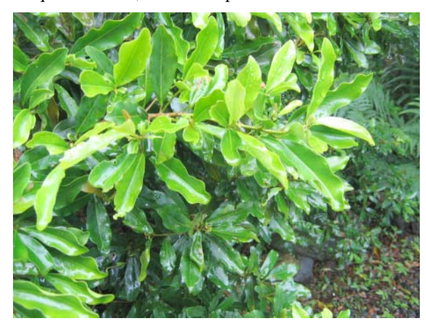
Muttonwood at the Barung Nursery.

Muttonwood is generally seen as an attractive glossy-leaved understorey shrub growing three to five metres tall, and is often prevalent in the seedling-to-1.5 metre understorey component. It may, however, be found growing to 15 metres in mature rainforest. In the open, it can form a dense rounded shrub, bushy to ground level. Under dry conditions it may drop inner foliage but usually maintains an attractive appearance. Foliage is stiff and glossy, with leaves 3-9 cm long, simple, alternate and generally obovate, (sometimes oblanceolate or elliptic). Leaves of young plants are toothed, whereas older plants have leaves with attractive wavy margins and the occasional tooth, rarely with the odd leaf showing some lobing. The shape, number of teeth, and degree of waviness can be quite variable, hence the species name variabilis .