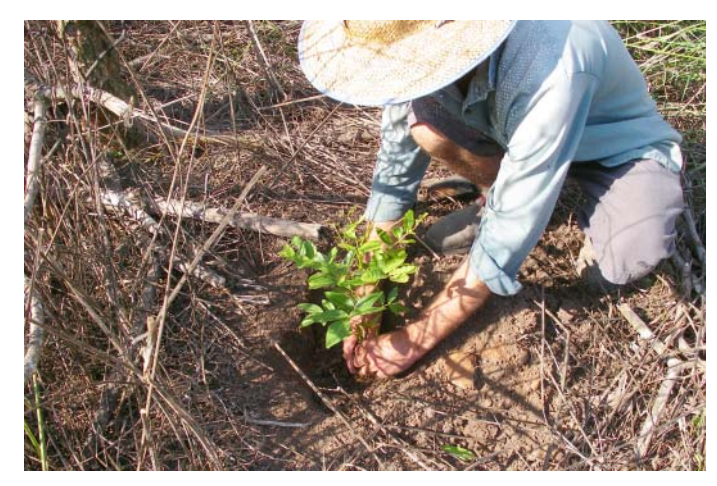
Time for trees in the ground.

ring Jolyon - 0429 943 156 or Barung Office - 5494 3151