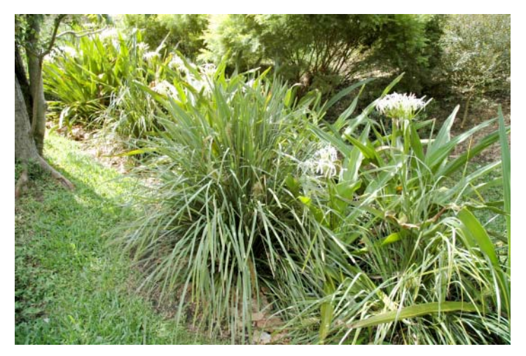
Gully line with crinum and lomandra.

It's been a season for observation rather than physical work but it's useful to pause occasionally, note what nature is up to, and reassess future plans. Successful and above all enjoyable gardens live within their landscapes and often take unexpected turns.