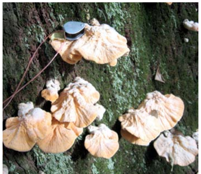
Curry Punk on the stump.

Curry Punk is known to occur on dead eucalypts and is often present after bushfires. It causes a brown rot.