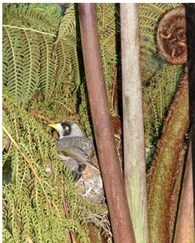
Noisy Miner nesting in a treefern next to our verandah.

The Noisy Miner prefers open grassy eucalypt forests and woodlands. It has probably lost a chunk of its pre-European habitat, but rural clearing patterns and urban development have given them a big advantage over many other native species. Paddocks with fringes of eucalypts and gardens dominated by lawns with scattered eucalypts and prolifically flowering native shrubs such as grevilleas and bottlebrushes provide a haven for these birds. In these open landscapes they can see other birds approaching and launch a mission to drive the competitors out. Short grass also allows them to spot predators. The eucalypts harbour psyllids, sap-sucking insects which secrete a sugary shelter around their body, providing a great sugar source when there is little flowering in the landscape. And the extensive planting of long-flowering, nectar-rich native shrubs in gardens gives Noisy Miners a great additional food resource. Many other native birds would love to utilise these same food resources but they just can't stand up to being mobbed by a big band of Noisy Miners.