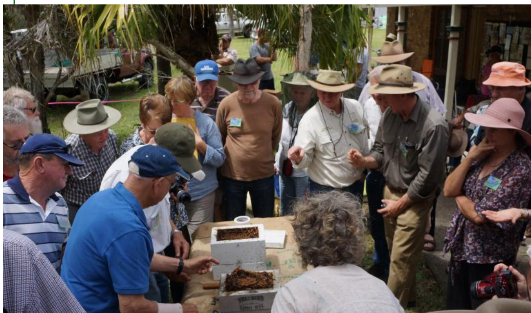
Native stingless bee hives workshop at Barung's Landsborough Nursery

Further information can be obtained by emailing rangebees@live.com.au