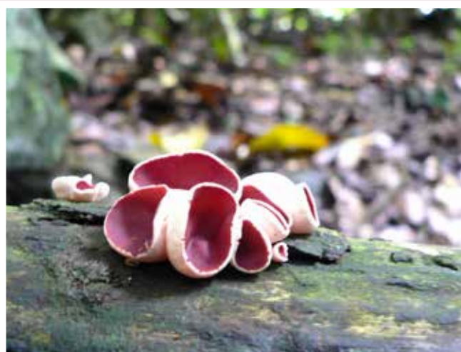
Phillipsia subpurpurea, opposite and above, on logs at Mary Cairncross Scenic Reserve

It usually grows in rainforest and at certain times of the year may be found growing on fallen logs in Mary Cairncross Scenic Reserve. It plays an important role in the ecosystem as a decomposer of dead wood.