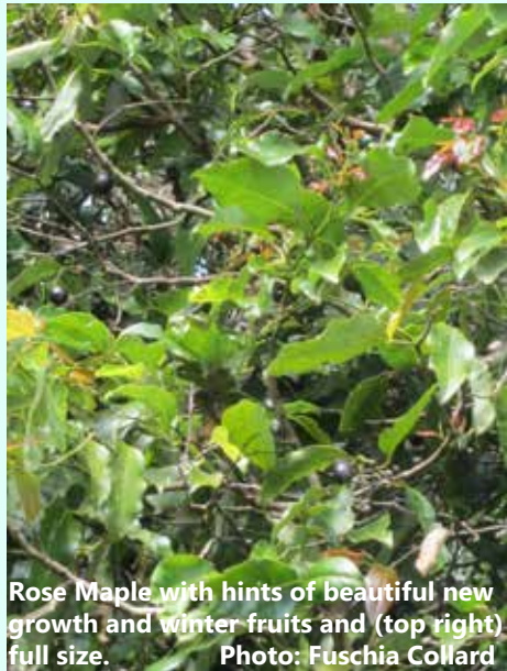
Rose Maple with hints of beautiful new growth and winter fruits and (top right) full size.

The trunk may be slightly buttressed but is generally cylindrical with a conspicuous white or grey, corky bark which is fragrant when cut or crushed. The adult leaves are alternate with entire margins, elliptical approximate 5-13 by 2.5-3.5