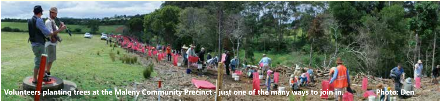
Volunteers planting trees at the Maleny Community Precinct - just one of the many ways to join in.