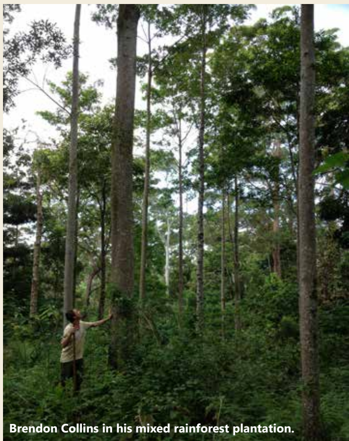
Brendon Collins in his mixed rainforest plantation.

Carol can be contacted at E: carolneal@bordnet.com.au P: 07 3425 2332 or M: 0411 87332. (more photos next page)