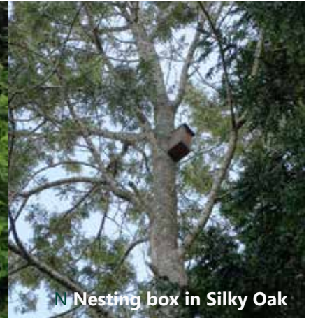
Nesting box in Silky Oak

Gardens for Wildlife has been sharing ideas about how we can create a wildlife friendly setting around our homes. But more valuable than this is for your neighbours to join you in creating habitat to support more of our local wildlife. To enhance this even further we could look at how neighbouring properties could provide linkages between reserves and other natural areas.