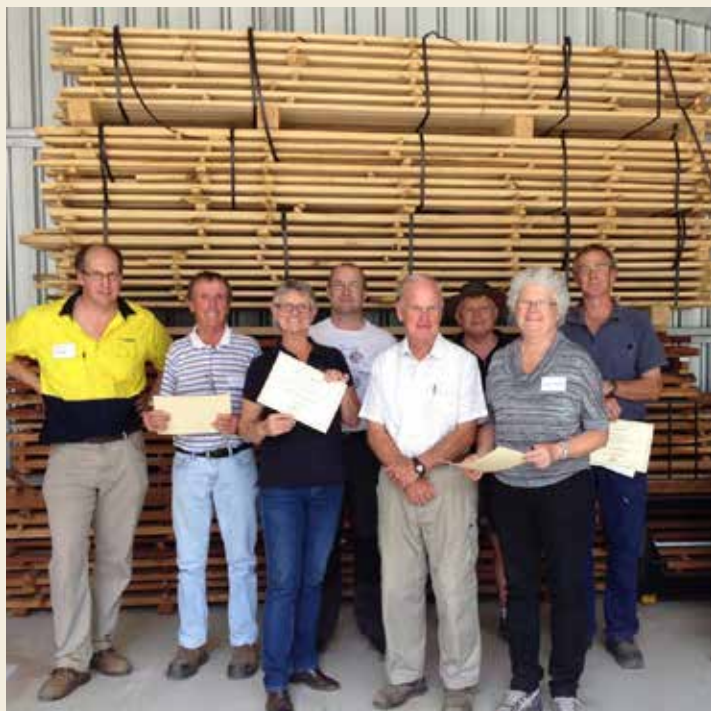
Group members receive their ForestSmart FSC® Certificates.

Most plantings are around 8-12 years of age, traditionally believed to be too young to make timber processing tenable. The growers met to discuss the benefits of group certification, and ultimately became certified under the PF Olsen (Australia) ForestSmart Forest Stewardship Council (FSC®) Certification Scheme - the first of its kind in Australia. PF Olsen (Aust) Pty Ltd uses the FSC® trademarks in accordance with the terms and conditions of its license from the Forest Stewardship Council® - PF Olsen (Aust) Pty Ltd's trademark C112244. Certification can give us the leverage we need to access more specialised markets.