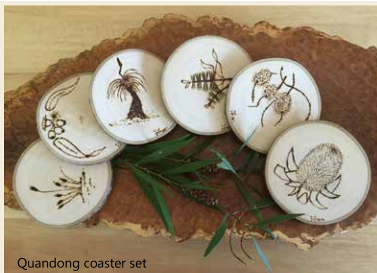
Quandong coaster set

The motion to take to the AGM might be: 'That Barung Landcare Inc adopt the revised rules which consist of the current Model Rules, our existing objects, provisions required to operate the Barung Environmental Gift Fund and the requirement of 2 signatories to authorise payments by electronic transfer'.