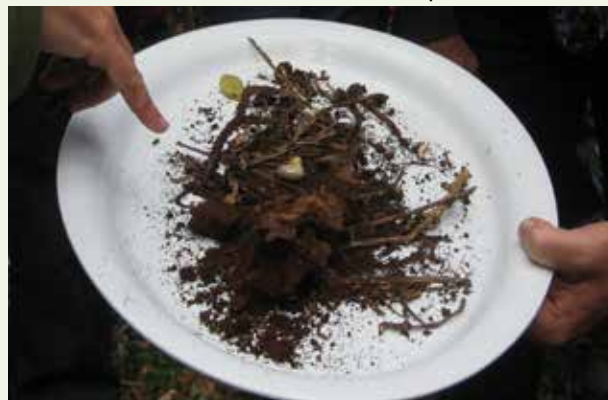
L to R: Participants examining the host of grubs, beetles, worms and spiders discovered in April's Gardens for Wildlife workshop. Invertebrates were found by turning over logs and examined in dishes.

I would recommend any local small landholders with an interest in our local flora and fauna, to join Gardens for Wildlife as we have people with an amazing depth of knowledge, keen to pass this on to those interested. For further information, contact Barung Landcare.