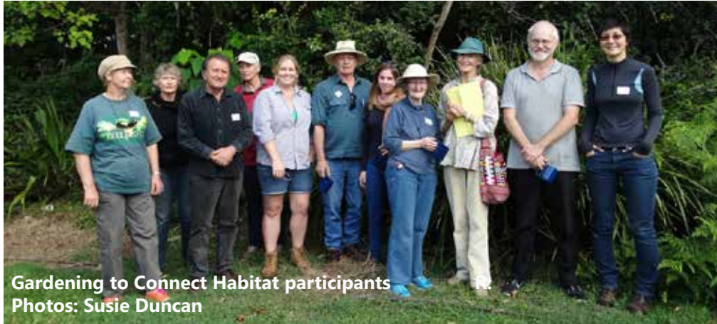
Gardening to Connect Habitat participants