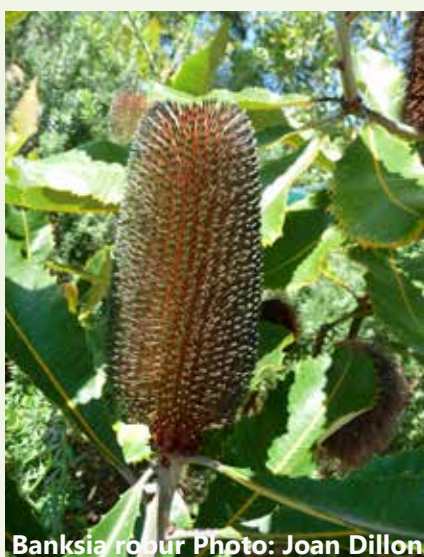
Banksia robur

Winter arrived with a welcome slowing of weed growth. The early May downpour, whilst causing quite a bit of damage, did replenish the soil moisture and autumn growth was better than is often the case. It was an ideal time to be out in the garden during those clear, cool days.