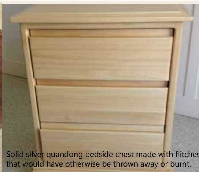
Solid silver quandong bedside chest made with flitches that would have otherwise be thrown away or burnt.